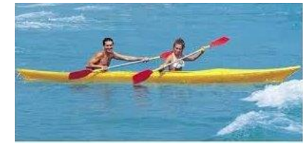
Class D - K2 Touring, etc. – Double