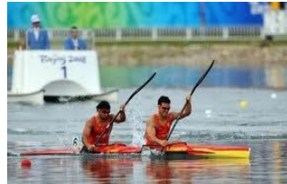
Class B - K2 Racing Double