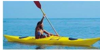
Class C - K1 Touring/Sea Kayak