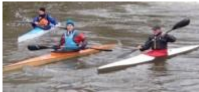
Class A - K1 Racing Single

Class Guide - Classes A to P are available.