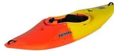
Class G-J - Slalom (e.g Fusion, G3 GTS)