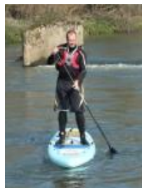
Class L - SUP (single or double)