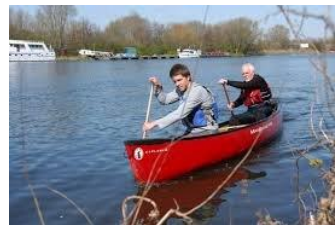
Class F - C2 Touring Canadian Double