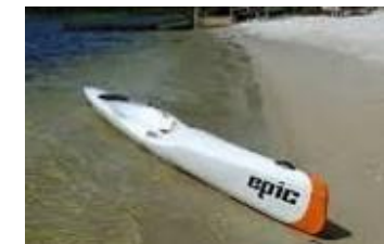
Class N - Surf Ski