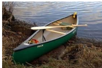
Class E - C1 Touring Canadian Single