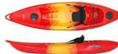
Class M - Sit-on (single or double)