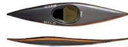
Class G-J – Slalom