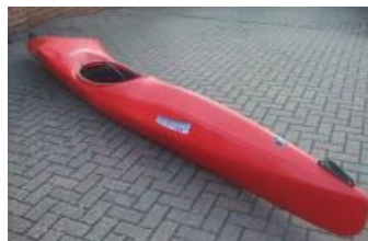
Class K - Wild Water Racer (e.g. Wavehopper)