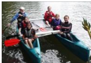
Class P – Katananus (Treat as Adult Doubles Team when entering naming two primary paddlers)